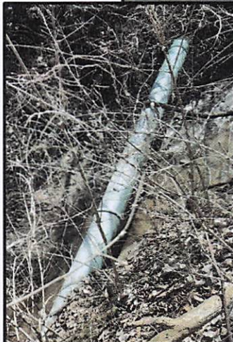
Pipe used to be below the bottom of the stream. Erosion has exposed this infrastructure along with significant cuts/erosion on the banks in the area. Need to restore sections of the creek channel to protect this and other infrastructure.